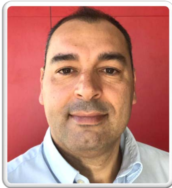
Professional Miner Bitcoin Maximalist Blockchain Developer Co-Founder